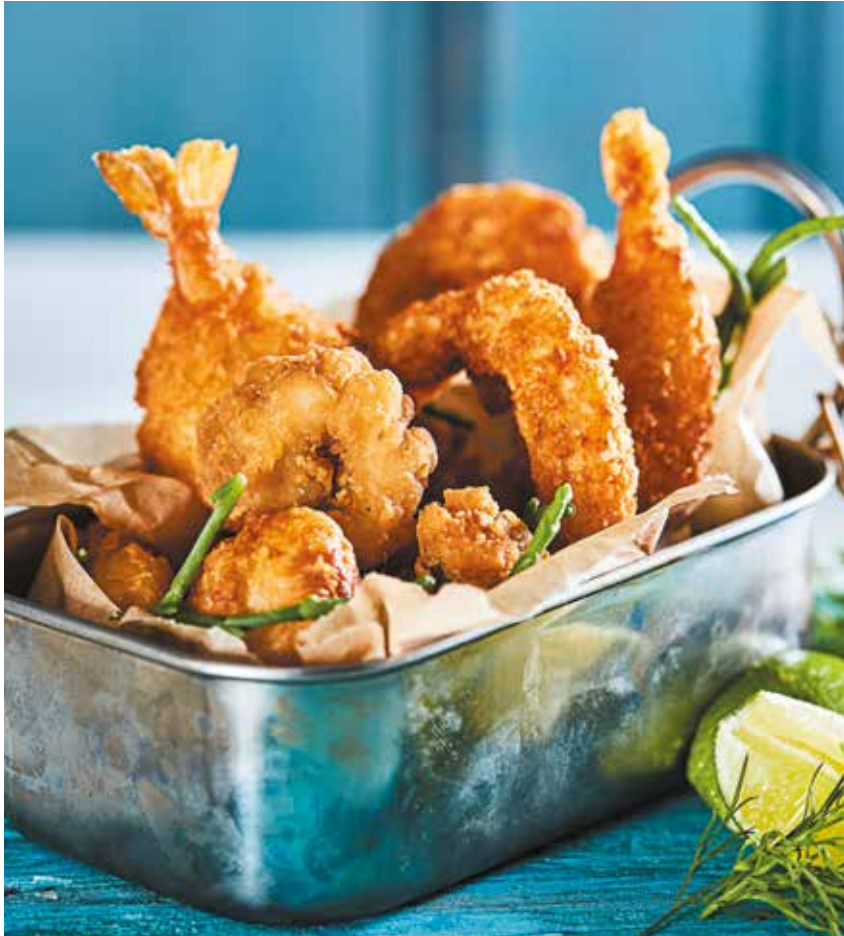
98518 Pacific West Coated Seafood Basket 1 x 200g £3.95

This scrumptious seafood basket includes Panko Squid Rings, Breaded Butterfly Prawns, Crispy Battered Chunky Cod Bites and Salt & Pepper Squid Chunks. The perfect dish for your customers who can't choose between one seafood dish and another! Great for starters or sharing platters.