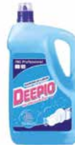
85971 Deepio Washing Up Liquid 1 x 5ltr £9.50