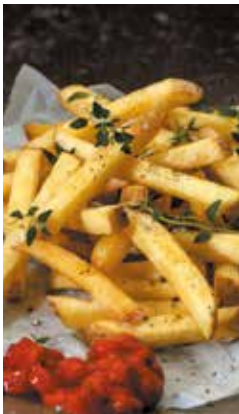
12768 McCain Surecrisp Medium Chips Skin-On 4 x 2.27kg £18.99 🍷