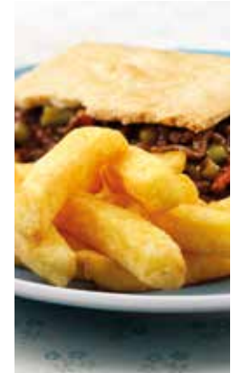
58710 McCain Surecrisp Traditional Chips 4 x 2.27kg £26.99 🍷