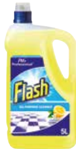
29957 Flash Lemon APC 1 x 5ltr £10.65