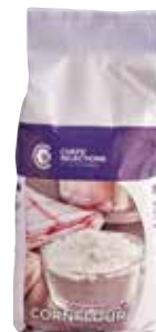
40950 Chefs' Selections Cornflour 1 x 3.5kg £6.85