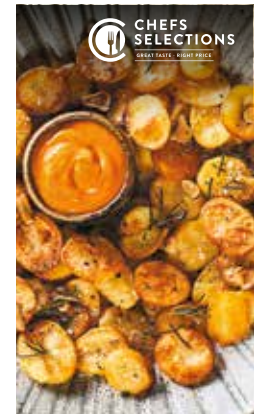
96244 Chefs' Selections Sauté Potatoes 4 x 2.27kg £18.38 🍷