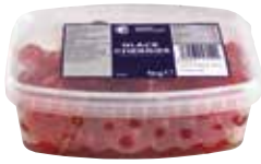
96113 Chefs' Selections Whole Glace Cherries 1 x 1kg £7.80