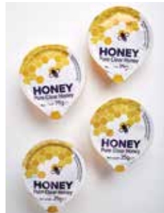
60957 Chefs' Selections Honey Portion Pots 100 x 25g £15.25 | 15p each