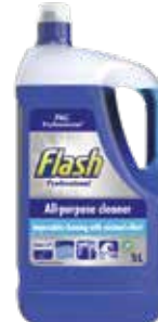
15084 Flash Ocean APC 1 x 5ltr £10.65