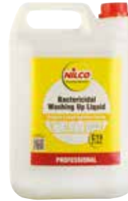
33722 Nilco Bactericidal Washing Up Liquid C15 1 x 5ltr £14.50