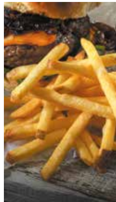
68555 McCain Surecrisp Julienne Skin-On 4 x 2.27kg £18.99 🍷