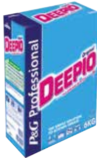
34772 Deepio Grease Buster 1 x 6kg £13.90