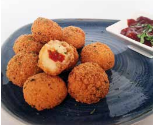
16817 Innovate Margherita Pizza Bites 1 x 1kg £12.50 🍷