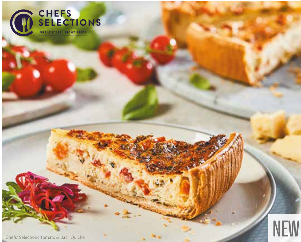
Chefs' Selections Tomato &amp; Basil Quiche