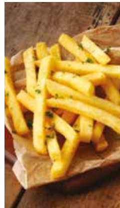
52692 McCain Surecrisp Thin Cut Skin-Off 4 x 2.27kg £18.99 🍷