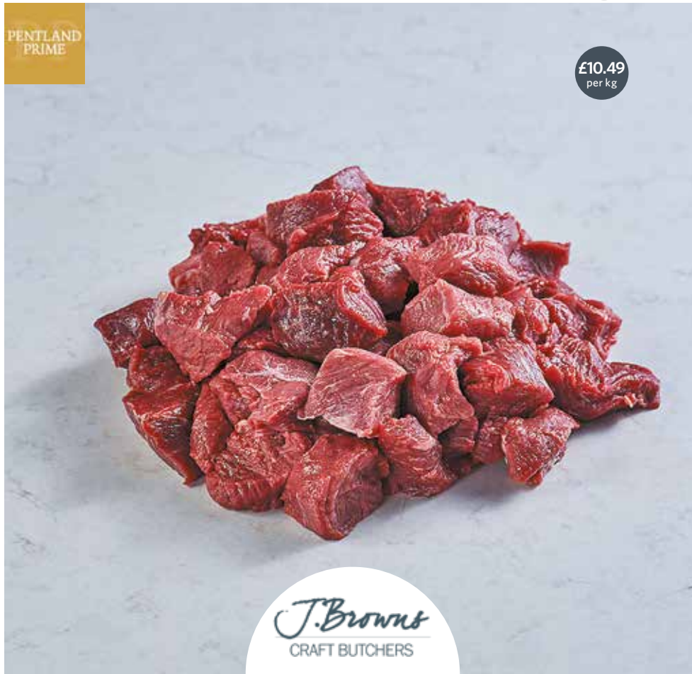
53917 Pentland Prime 98% VL Hand Diced Stew Scottish 1 x 5kg £10.49 per kg

85% of our J.Browns Craft butchers range is proudly Scotch and Scottish Origin. We understand that provenance and specification is everything. We want to be really clear about the origin, quality and maturation of each cut in our range. That's why all of our products clearly indicate origin in the name.