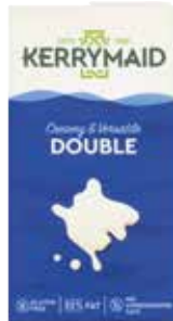
17872 Kerrymaid UHT Double 12 x 1ltr £47.50 | £3.96 each