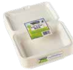
40748 Caterpack Enviro Fish & Chip Box 6x9" 1 x 50 £8.99 | 18p each