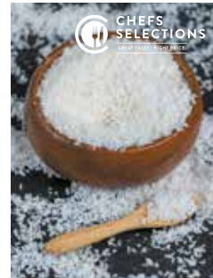
87181 Chefs' Selections Desiccated Coconut 1 x 1kg £5.50