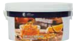
81424 Chefs' Selections Orange Marmalade 1 x 2.72kg £6.88