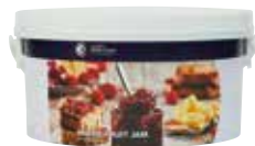
80844 Chefs' Selections Mixed Fruit Jam 1 x 2.72kg £7.85