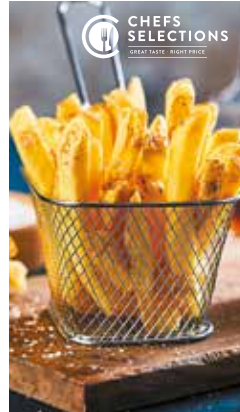
88167 Chefs' Selections Coated Chips Skin-On 9mm 4 x 2.27kg £19.55 🍷