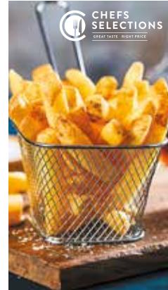
18531 Chefs' Selections Coated Chips Skin-On 12mm 4 x 2.27kg £19.47 🍷