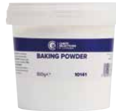
63060 Chefs' Selections Baking Powder 1 x 800g £3.23