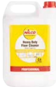
21775 Nilco Heavy Duty Floor Cleaner 1 x 5ltr £10.70