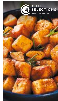
13218 Chefs' Selections Seasoned Cubes 4 x 2.27kg £18.85 🍷