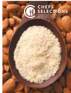
92342 Chefs' Selections Ground Almonds 1 x 1kg £9.75