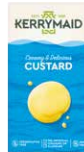
16006 Kerrymaid RTS Custard 12 x 1ltr £26.31 | £2.19 each