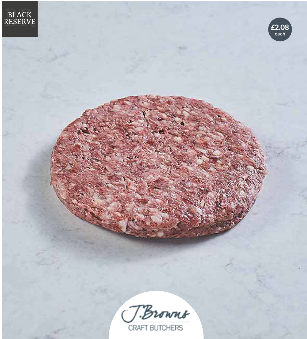
16289 Black Reserve Wagyu-X Burger (Frozen) 6oz Scottish 24 x 170g £49.95 | £2.08 each