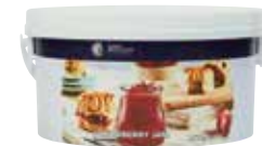
52803 Chefs' Selections Strawberry Jam 1 x 2.72kg £8.68