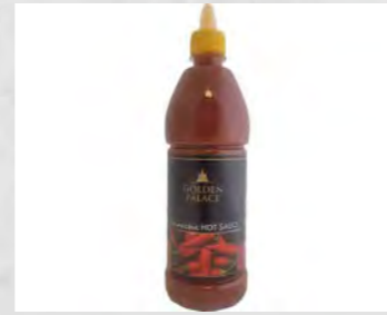
75354 Sriracha Hot Sauce 1x770ml £4.25

Sriracha Hot Sauce delivers a bold, spicy kick to your menu. Use it to spice up burgers, stir-fries or sushi rolls or mix into sauces and dressings for extra heat. A must have for heat lovers!