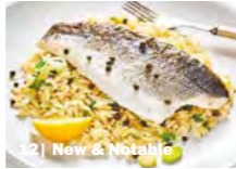
12 | New & Notable

Promotional pricing available when ordering through JB Provisions Marketplace app.