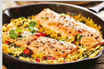
Recipe Idea - Chef Selection's Sweet Chilli Salmon (49913) with rice.

Thai Sweet Chilli Sauce adds a perfect balance of sweet, spicy, and tangy flavour's. Use it as a dipping sauce, a glaze for meats or a topping sauce for seafood.