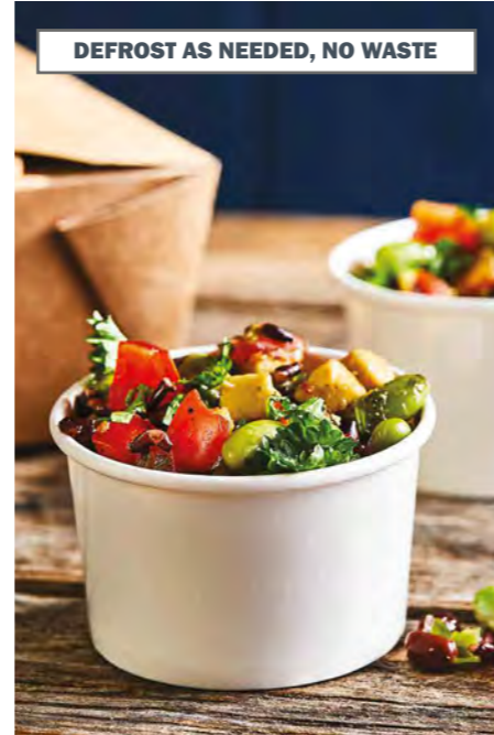
Simple side salad