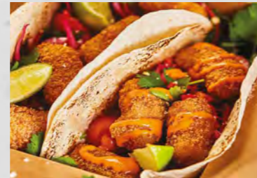
Recipe Idea - Whitby Scampi (60328) Tacos with sriracha mayo.

Sriracha Hot Sauce delivers a bold, spicy kick to your menu. Use it to spice up burgers, stir-fries or sushi rolls or mix into sauces and dressings for extra heat. A must have for heat lovers!