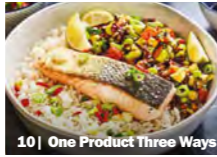
10 | One Product Three Ways