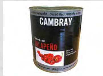
27134 Sliced Red Jalapenos 1x3kg £1.73 per kg

Red Jalapenos are left to mature longer on the vine, giving them the lovely red colour. They have slightly more spice than classic green jalapenos and a slightly sweeter taste. Did you know Sriracha hot sauce uses red jalapenos as its base?