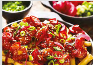
Recipe Idea - Crispy Chicken with Chef Selection's loaded fries (99237)

Red Jalapenos are left to mature longer on the vine, giving them the lovely red colour. They have slightly more spice than classic green jalapenos and a slightly sweeter taste. Did you know Sriracha hot sauce uses red jalapenos as its base?