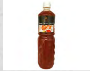
91620 Thai Sweet Chilli Sauce £3.25

With over 2,500 products in our collection, we'd like to highlight some of the standout ingredients that make our range truly special. This month we decided to feature some ingredients to add some spice to your menu.