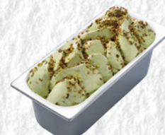
PISTACHIO TOPPED WITH ROASTED CALIFORNIAN PISTACHIO PIECES