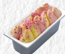
MARSHMALLOW BUBBLEGUM ICE CREAM WITH MARSHMALLOWS