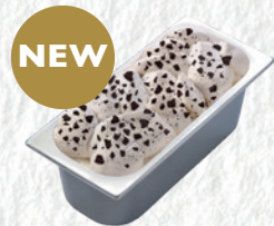
COOKIES & CREAM COOKIE AND CREAM FLAVOUR ICE CREAM, CHOCOLATE SAUCE AND CHOCOLATE COOKIE PIECES