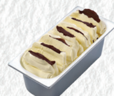
BANANA SPLIT V WITH CRUNCHY CHOCOLATE FLAVOUR PIECES