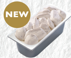
STRACCIATELLA ICE CREAM WITH CHOCOLATE SAUCE AND MILK CHOCOLATE PIECES