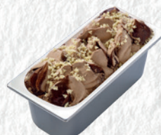
TRIPLE CHOCOLATE MILK CHOCOLATE ICE CREAM WITH CHOCOLATE SAUCE AND WHITE CHOCOLATE PIECES