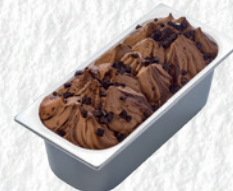
BROWNIE CHOCOLATE ICE CREAM WITH CHOCOLATE SAUCE AND BROWNIE PIECES