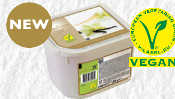
VEGAN VANILLA V VEGAN VANILLA ICE CREAM