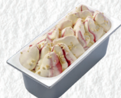
STRAWBERRY CHEESECAKE WITH STRAWBERRY SAUCE AND BISCUIT PIECES