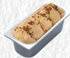
CARAMEL TOPPED WITH CARAMEL PIECES