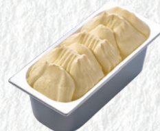
VANILLA VANILLA ICE CREAM WITH MADAGASCAN VANILLA EXTRACT