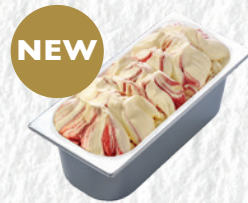
SPAGNOLA ICE CREAM WITH SOUR BLACK CHERRY SAUCE