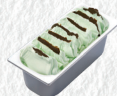
MINT CHOCOLATE WITH CRUNCHY CHOCOLATE FLAVOUR PIECES