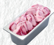
STRAWBERRY STRAWBERRY ICE CREAM