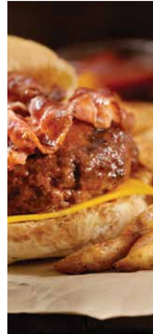
8 Stew & Braising

Delicious cuts ideal for Sunday roasts and date night steaks.