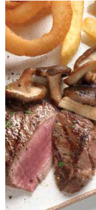
8 Beef Joints & Steaks

Inside you will find all our amazing fresh butchery products available for home delivery. We will be soon launching "A Little Book of JB" that includes the wider range of food products available. We stock an incredible 5000 food products and are delighted to offer them for delivery to homes. Our "Little Book" will include some recipe inspiration along the way.